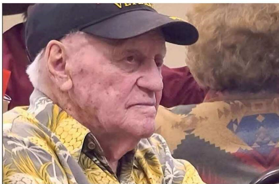
SPECIAL TO THE R-C

A6 | Wednesday, November 15, 2023 | The Record-Courier