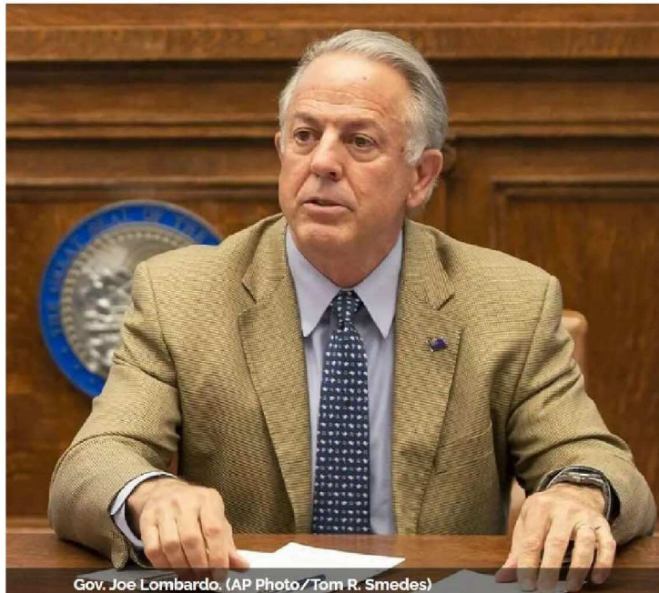
Gov. Joe Lombardo.

So how is that related to Nevada housing issues? This year home rule became a point of contention regarding housing issues at the state level. Senate Bill 371 (SB 371) and others vetoed by Governor Lombardo would open the door to limit a landlord's